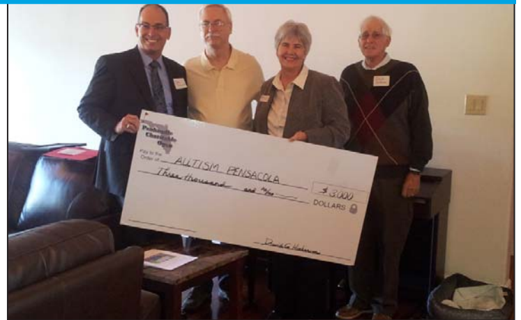
Panhandle Charitable Open donates to the API mission.