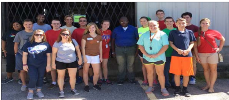
JTP teens gave back to the community at Manna Food Pantries.