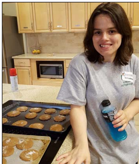
CLS interns made lunch - and dessert - for Ronald McDonald House guests.