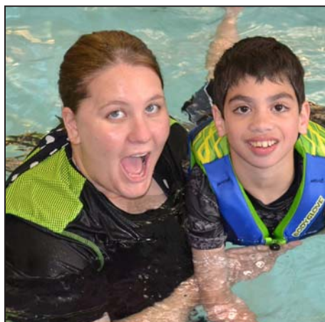
A trip to the Washington High pool is always a camp favorite.