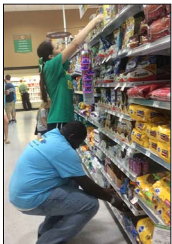
Camp included teaching job skills in the real world