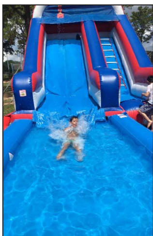
Campers enjoyed of bowling fun at Cordova Lanes, and kept cool with waterslides from Froman FUN.