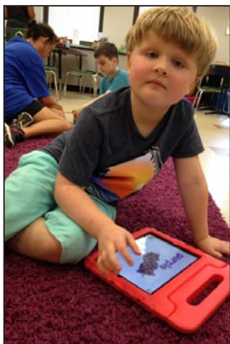
Campers work on individualized targets in the learning lab.