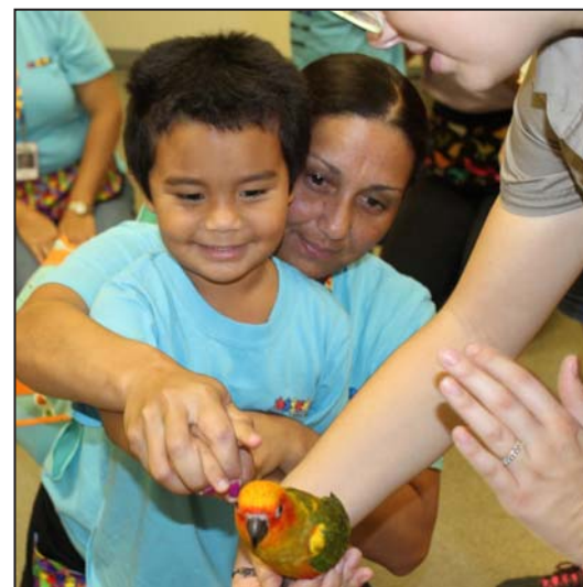
Petland always brings out the smiles.