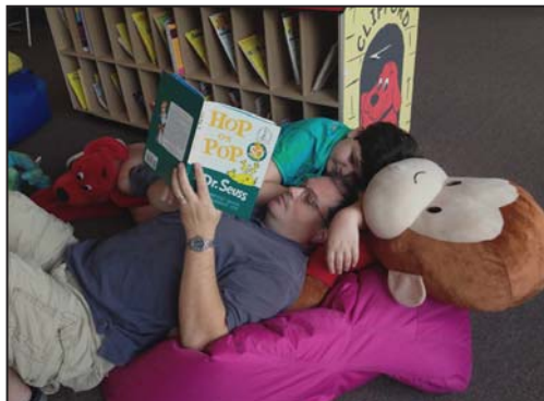
Kids and adults love the activities of the Imagination Station

Location: Pensacola Bayfront Stadium in downtown Pensacola, 351 W. Cedar Street, Pensacola, Florida 32502 (go south on Reus St. off of Main St. and you will end up at the front door of our location)