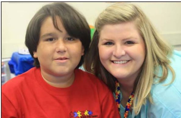
A young teen camper with his teacher.