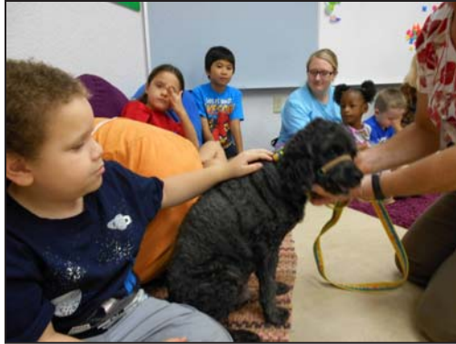
Therapy dog visits camp.