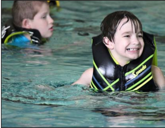
Swimming time is Happy Time!