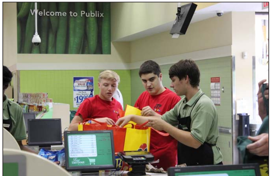
Job shadowing at Publix