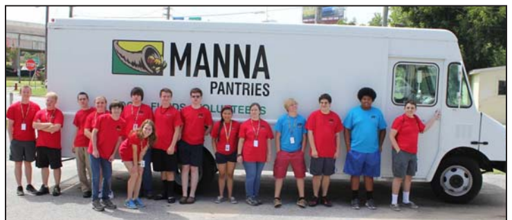
Giving back to the community.