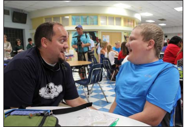
Camp is fun!