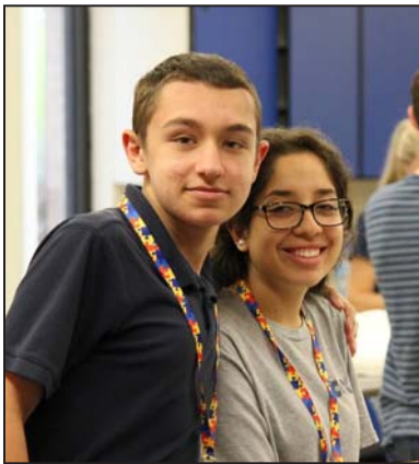
Making Friends at Camp

“Mitch enjoyed going every day. The work experience was wonderful, varied experiences, small groups - Outstanding!”