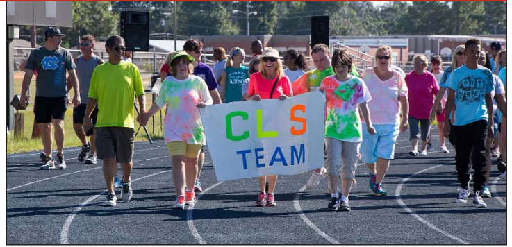
Team CLS represents in neon colors.

Project Empower meetings are held monthly on the third Tuesday from 11a.m. to 12:30 p.m. Central Time, at Marcus Pointe Baptist Church located at 6205 N. "W" Street, Building A, Door 4. You may also call in to (213) 416-1560 and use code 0607440. The next meeting is Oct. 20.