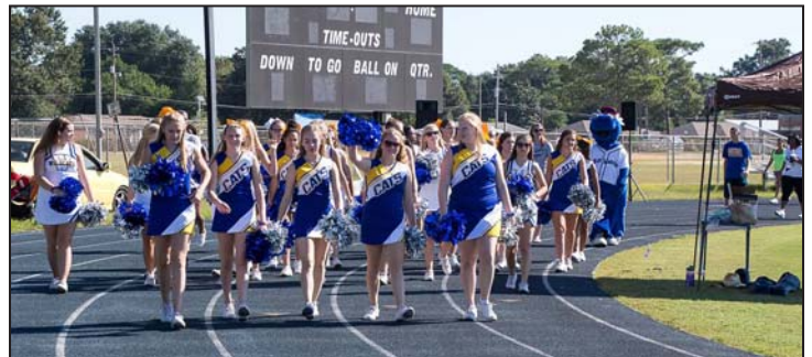
WHS cheerleaders lead the first lap for Steps for Autism 2015.