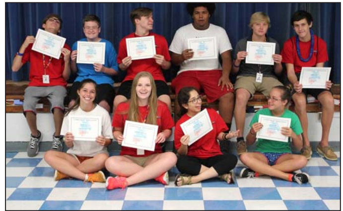
Teen peers are the best.