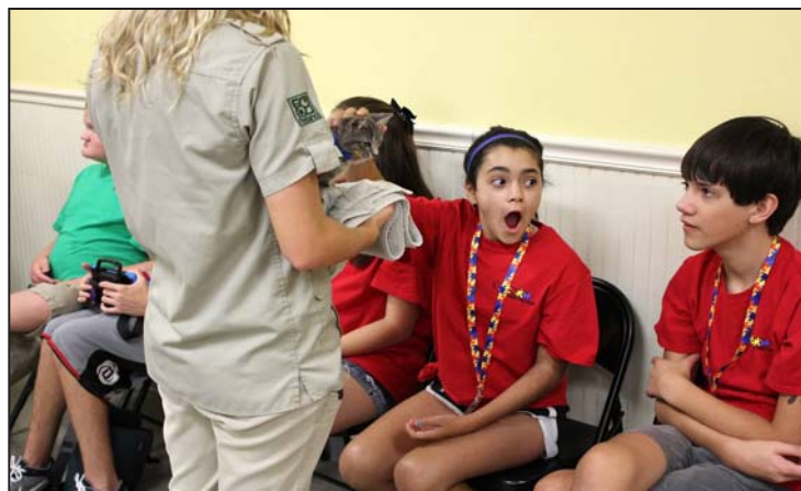
Petland field trip

Autism Pensacola’s Kids for Camp is a data-driven program using best-practice techniques, specifically Applied Behavior Analysis, to contribute to both the skill acquisition of the individuals with autism and the continuing education of the teachers, support staff, and college students who work with those with autism. API is committed to continuously improve the camp experience, thus remaining a model of quality and integrity to the community.