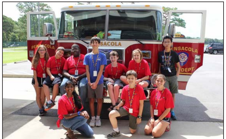
Community outings are part of the camp experience.