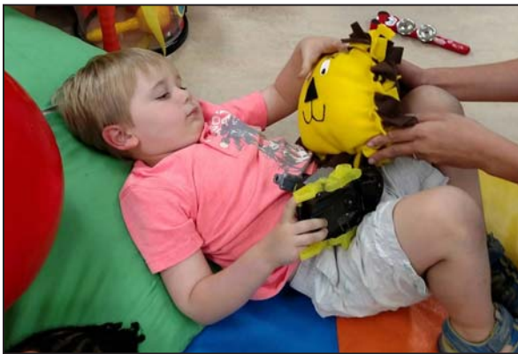
A Holm camper enjoys his lion pillow that was made by the Washington campers.